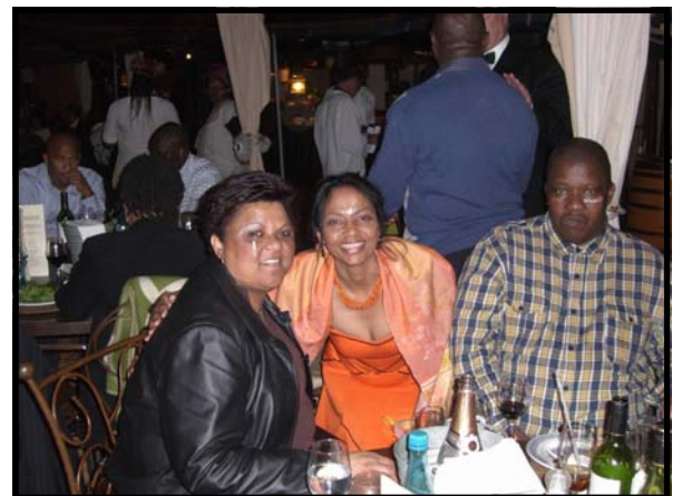
Guests enjoying themselves at the SAHF Housing Awards Ceremony